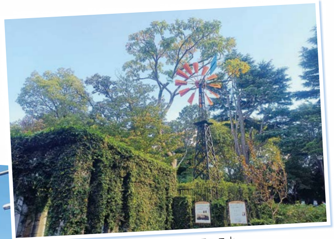
港の見える丘公園 フランス山